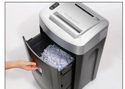
Easy to empty waste bin- Pull open front to empty shredded waste container.