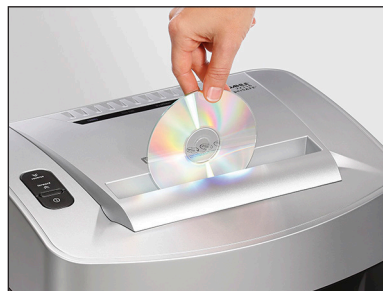
Multi+Media- This machine easily shreds CDs' credit cards, paper clips and staples.