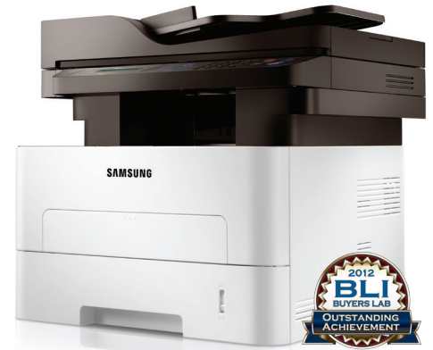
Outstanding Achievement in Innovation: Samsung Easy Eco Driver